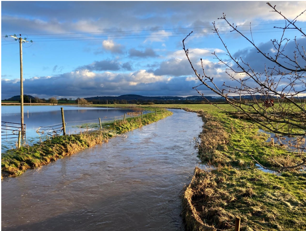
"The river Gowy, the day after the deluge" by Anne Smart